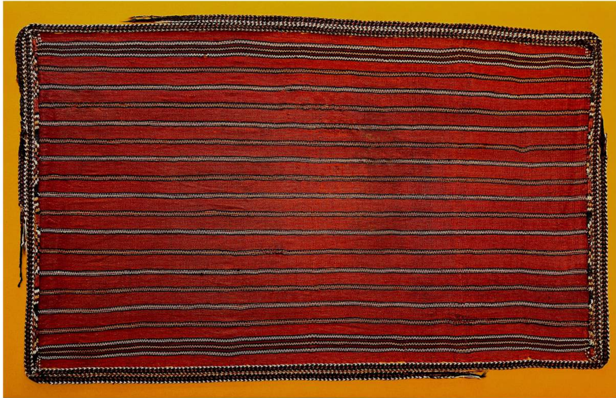
SIHUAS CULTURE Long Red Panel, Circa. 100 BC - 100 AD Camelid Fibres 38 x 77 cm