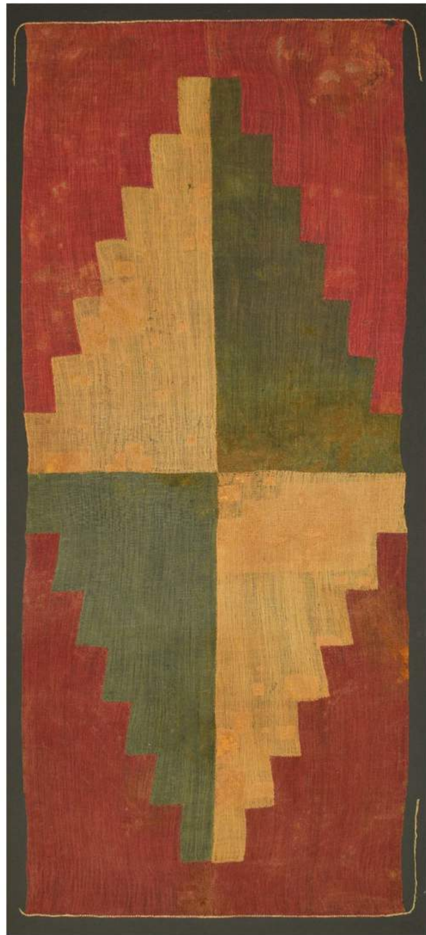
NAZCA CULTURE Larga Nazca Tunic, Circa. 600 AD Camelid fibres 85 x 206 cm