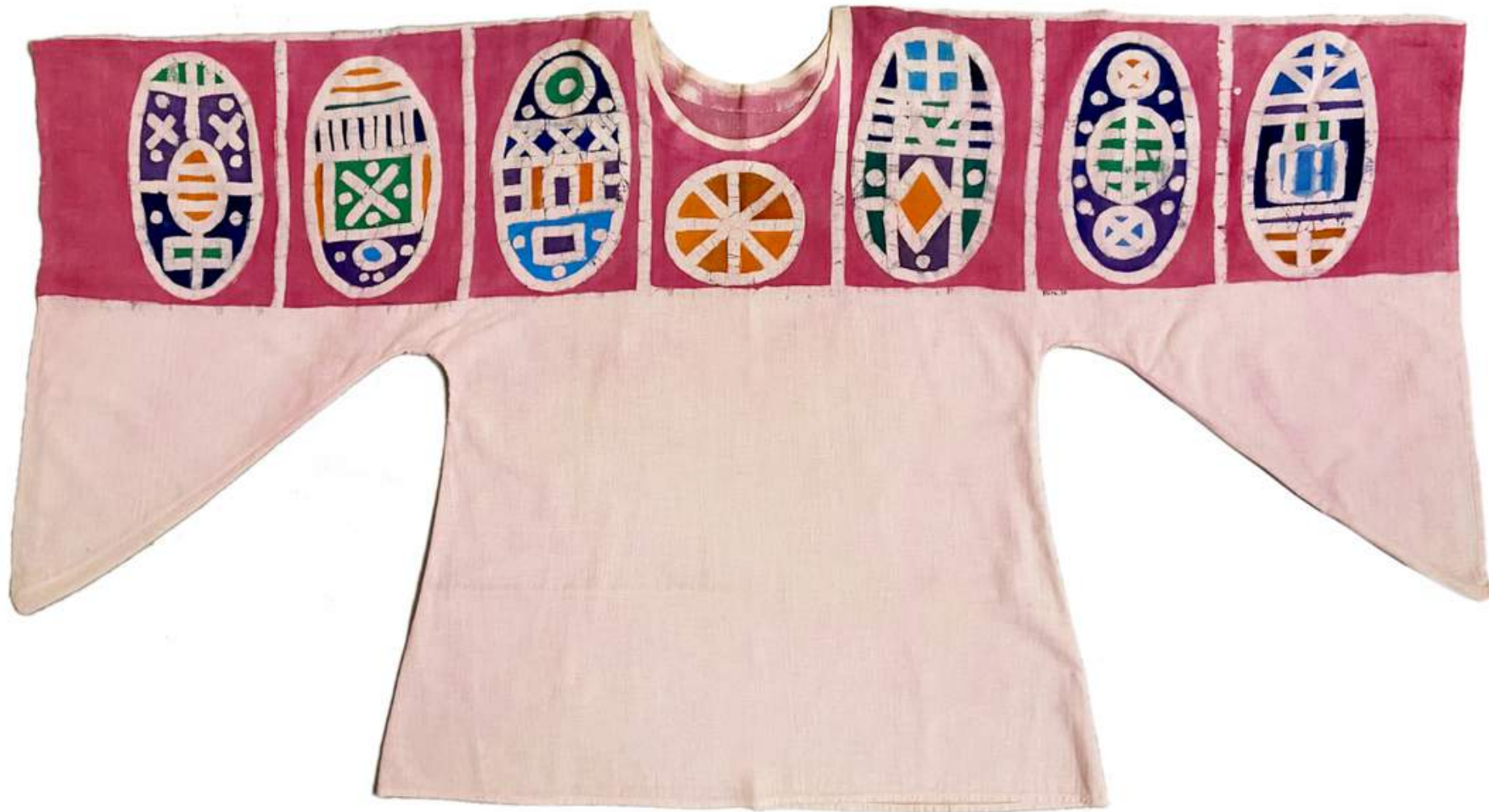
MIRA SCHENDEL Dress, serie "Bordados", 1975 Batik on fabric 75 x 165 cm