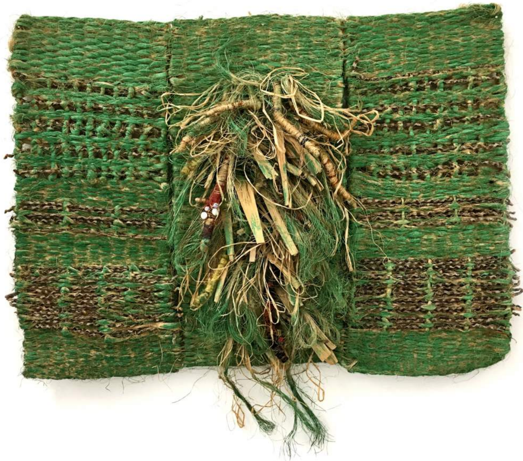
DELBA MARCOLINI Palmares, 1990 Handloom weaving agave fibres, maize fibres coastal straw, beads Andean Textiles 70X73x14cmt