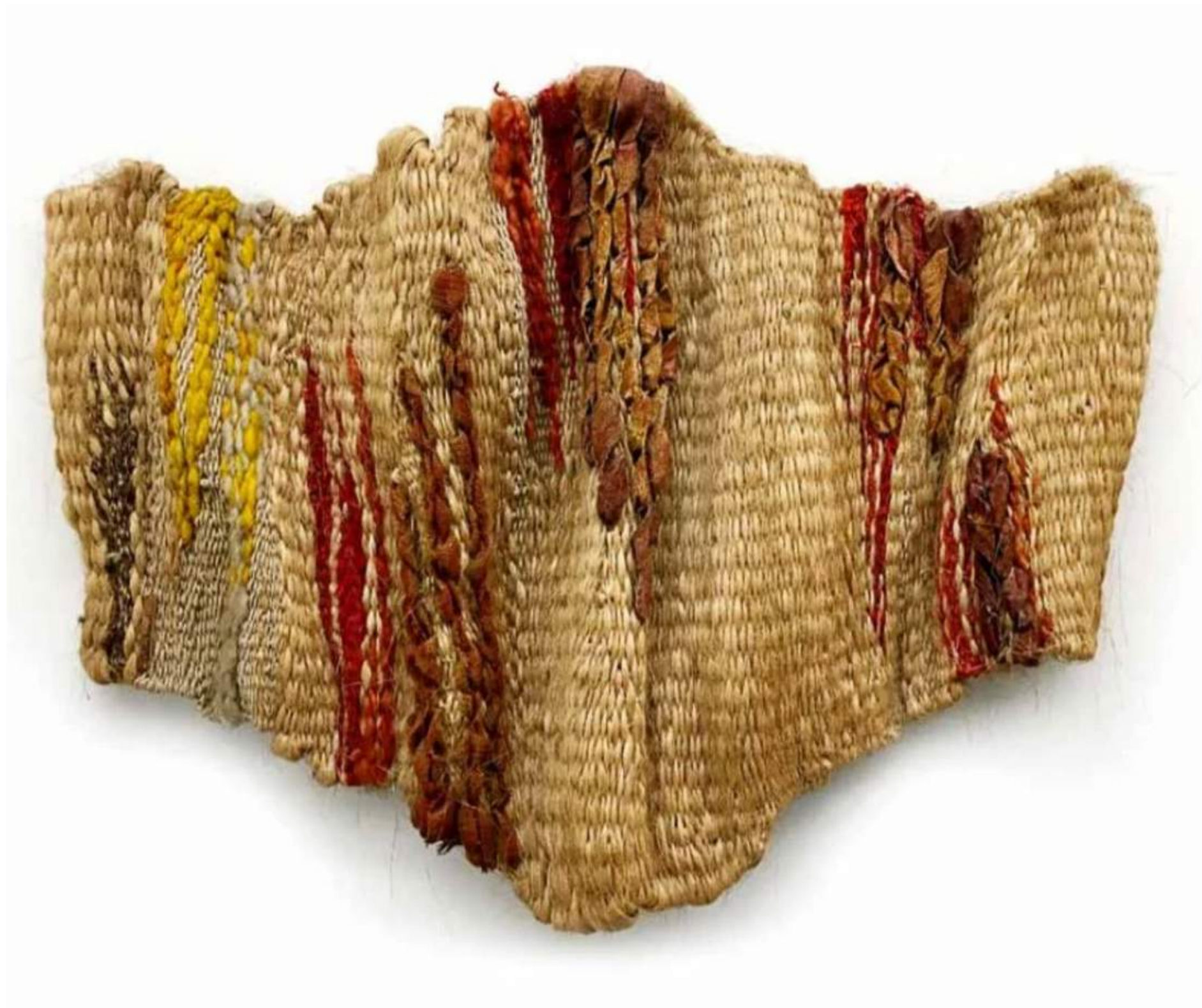
DELBA MARCOLINI Relevos, 1990 Handloom weaving, agave fibers, painted cotton, sheep's wool, rustic yarns Andean Textiles 80 x 108 x 10 cm