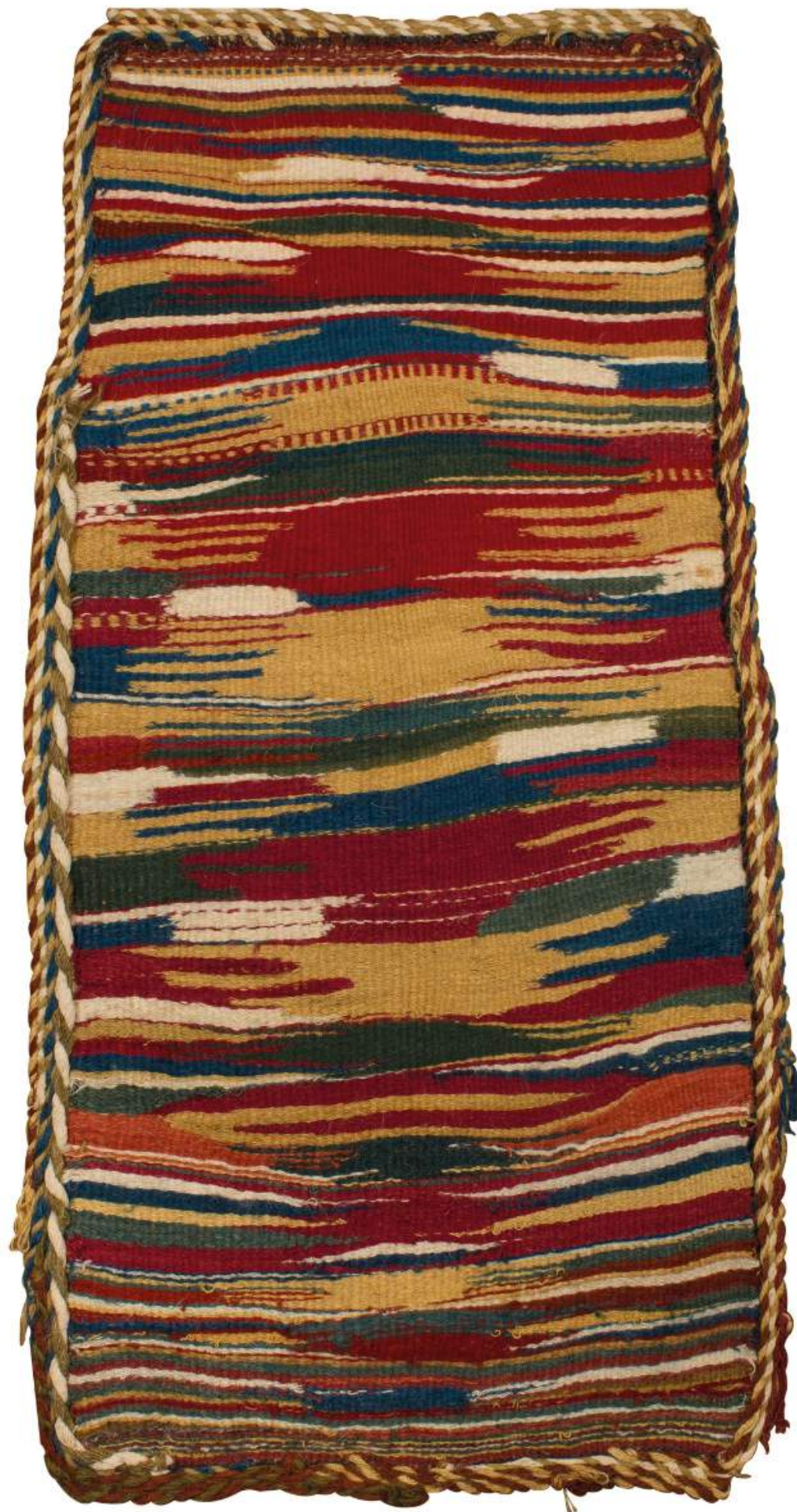
HUARI CULTURE Loincloth, Circa. 800AD Camelid fibres 73 x 38 cm