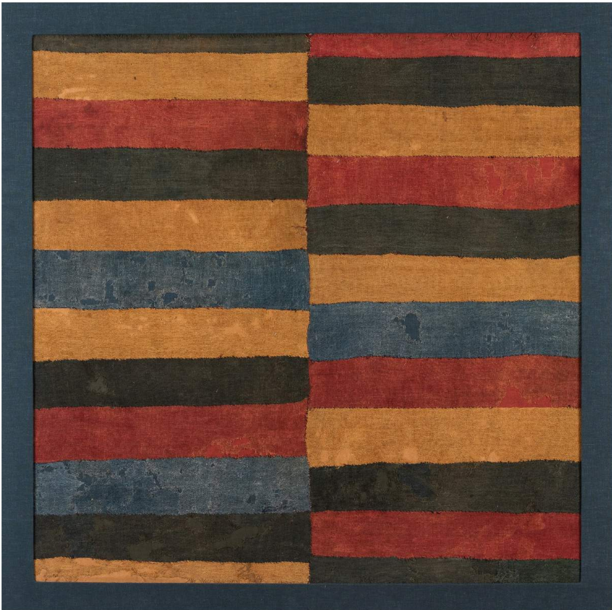
HUARI CULTURE Huari Tunic, Circa. 800AD Camelid Fibres 120 x 120 cm