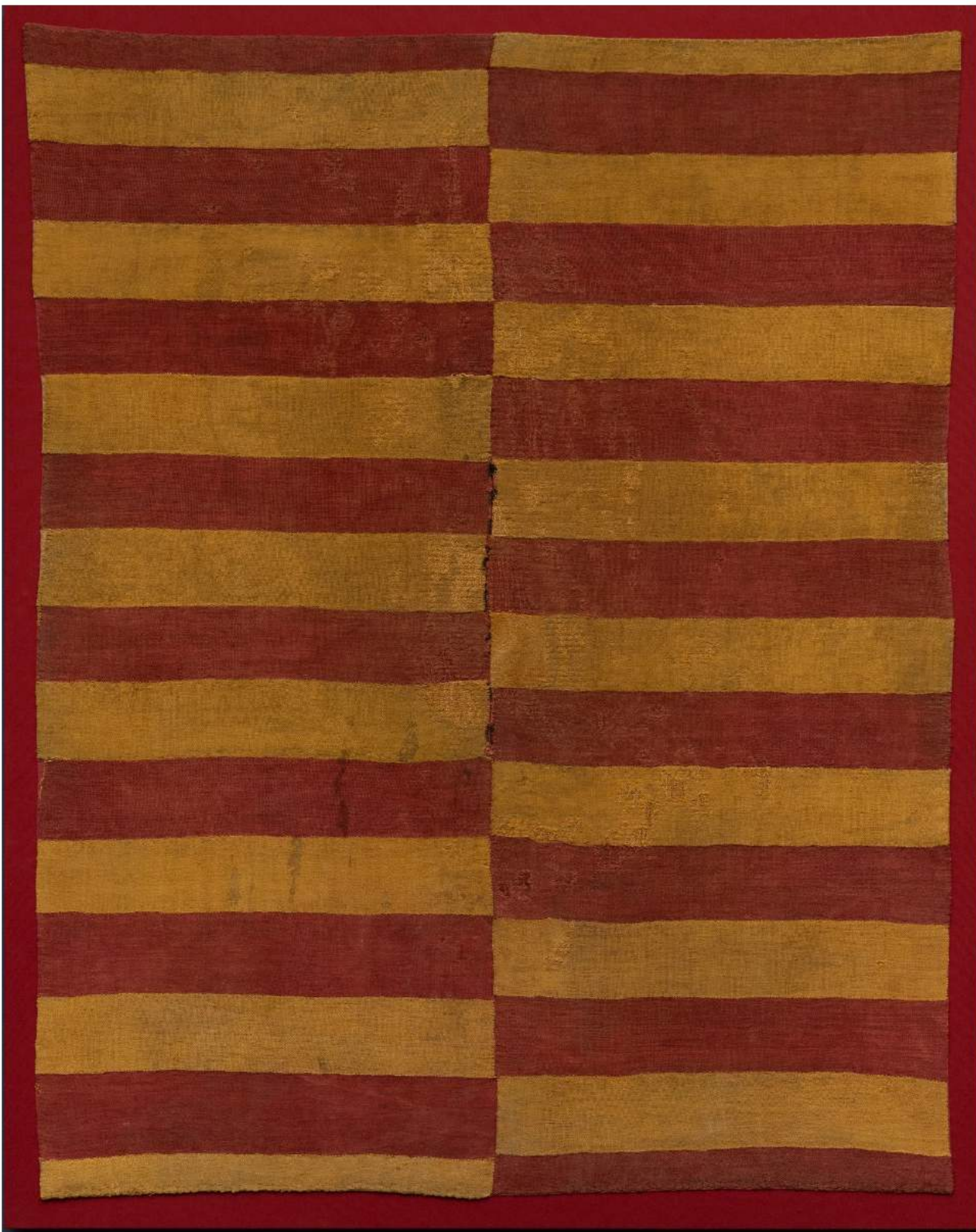
NAZCA CULTURE Striped Tunic, Nazca/Huari Red and Yellow/Green, Circa. 200AD Camelid Fibres 128 x 162 cm