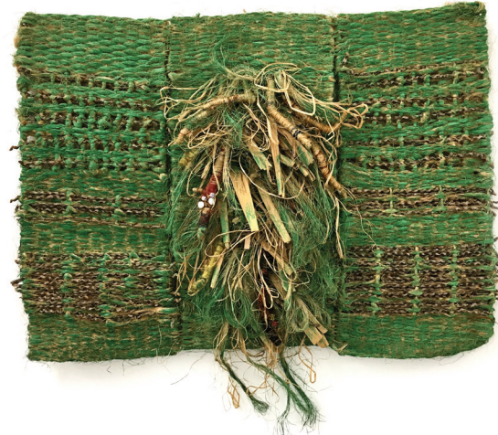
Delba Marcolini Palmares, 1990